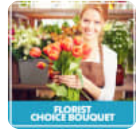
FLORIST CHOICE BOUQUET